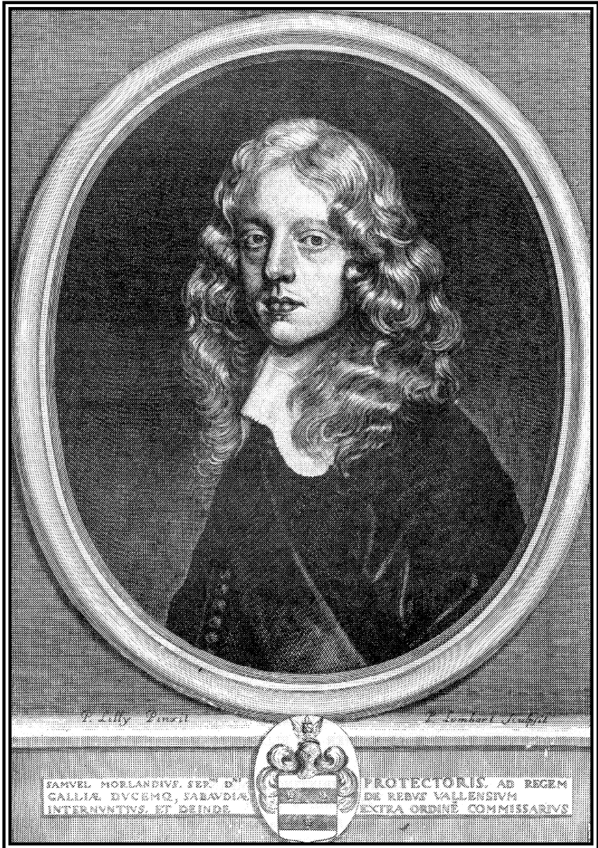
SAMUEL MORLAND 1625-1693